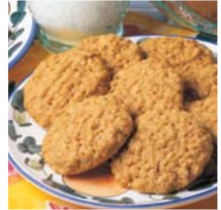
Cover: Decadent Chocolate Chippers, page 8 Back cover left: Gingersnaps, page 40 Back cover right: Sugar Cookies, page 46 Above left: Hazelnut Cookies, page 10 Above right: Peanut Blossoms, page 38 Page 1 left: Paintbox Cookies, page 44 Page 1 right: Wartime Cookies, page 24

Copyright © Company's Coming Publishing Limited All rights reserved worldwide. No part of this book may be reproduced, stored in a retrieval system or transmitted in any form by any means without written permission in advance from the publisher.