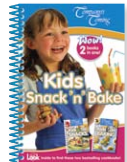
Kids Snack 'n' Bake

For a complete listing of our cookbooks, visit our website: www.companyscoming.com