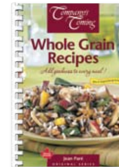
Whole Grain Recipes