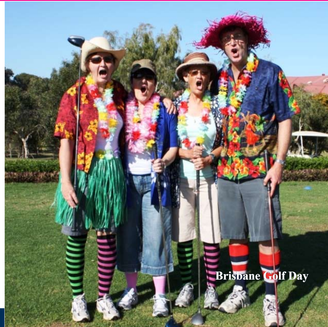
Brisbane Golf Day