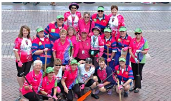
Dragons Abreast Composite