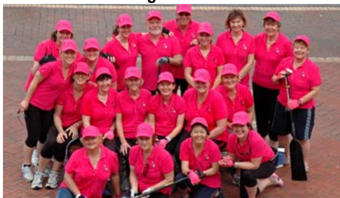
RNS Ryde Child & Family Health Nurses