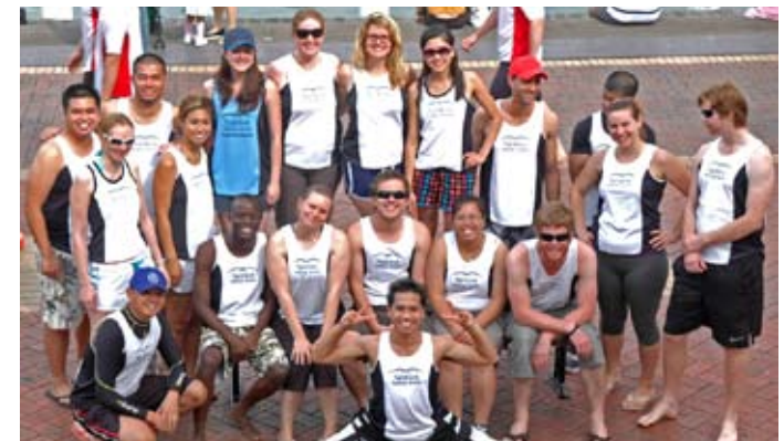
Night Hawk Radiology