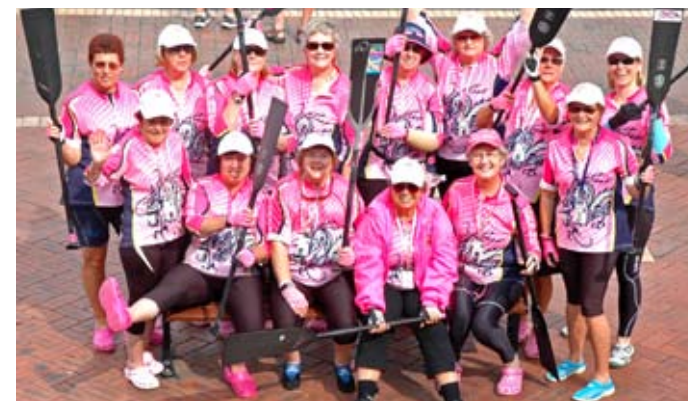
Dragons Abreast Central Coast