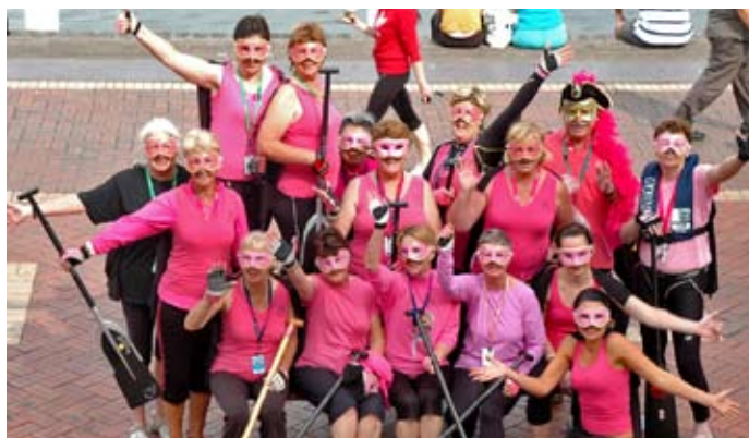
Ferry Park Fantoms