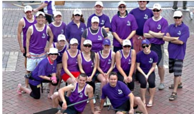
Gadens Crouching Tiger