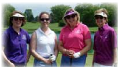
Girls just want to have fun!