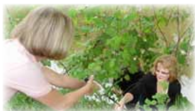
Looking for the money ball!