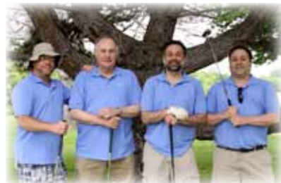
Event Sponsor Duperon Education