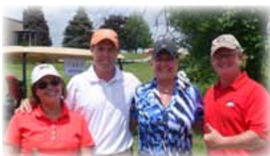
Ready to golf