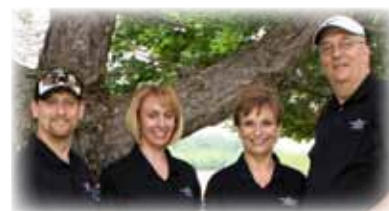
Here to play