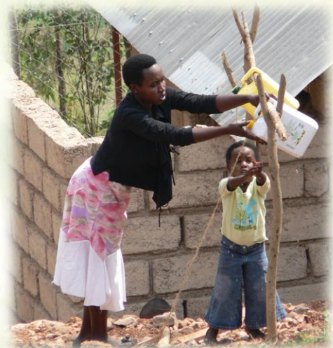
Learning to use a Tippy Tap

One of the many great things they taught was the simple procedure of washing hands and how important for hygiene this is. Everyone learned how to wash their hands and how to construct a simple 'Tippy-Tap' system at their homes. We agreed to give six bars of soap to every family who built a 'Tippy-Tap' system and we have already given out more than two hundred bars.