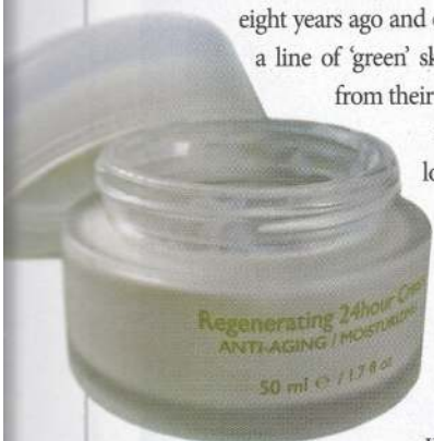
BIOselect products are not tested on animals.

BIOselect makes a cleansing milk that has a little higher pH to clean out the pores. You follow it with a tonic lotion that brings the pH level of the skin back to normal. "Customers with acne, rosacea or eczema say these are soothing," says Christina.