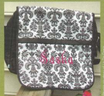
Monogramming is key at La De Daa's in Davidson.